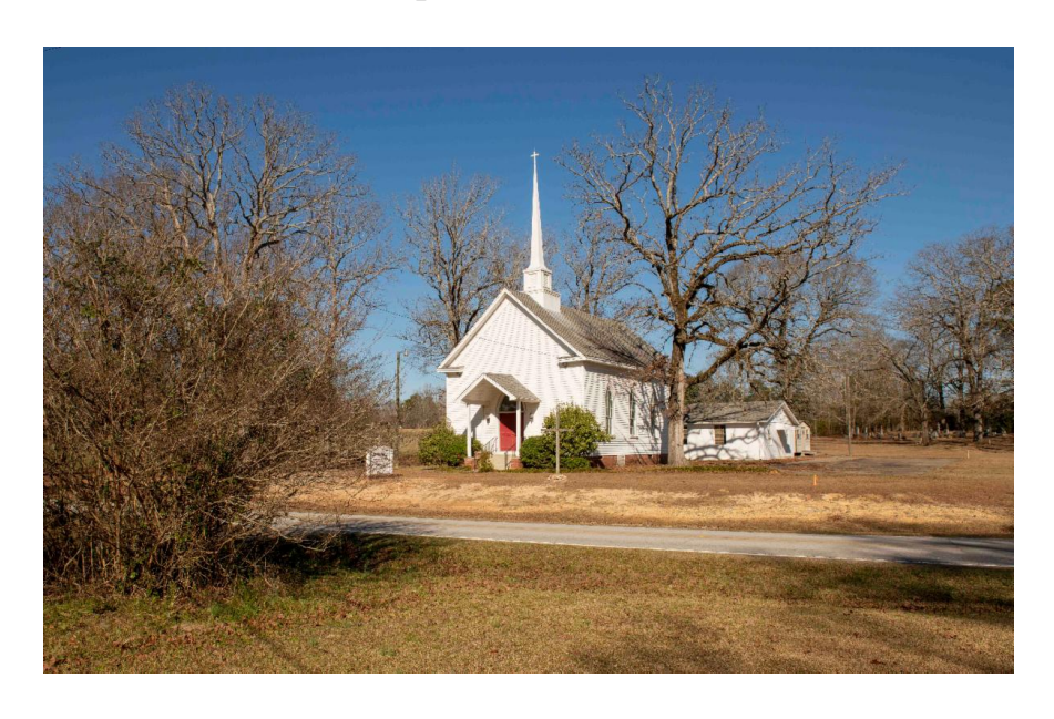
Mt. Olivet Church soon to Re-Open | PSC Sacred Spaces Series

In February of 2022, PreservationSC was approached by the remaining members of Mt. Olivet Church. Wishing to ensure the church will never be lost, the congregation donated it to PSC.